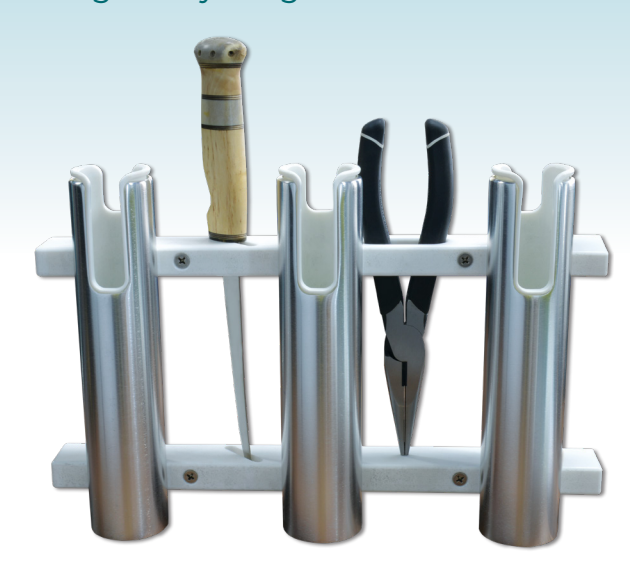
Tools and mounting hardware not included